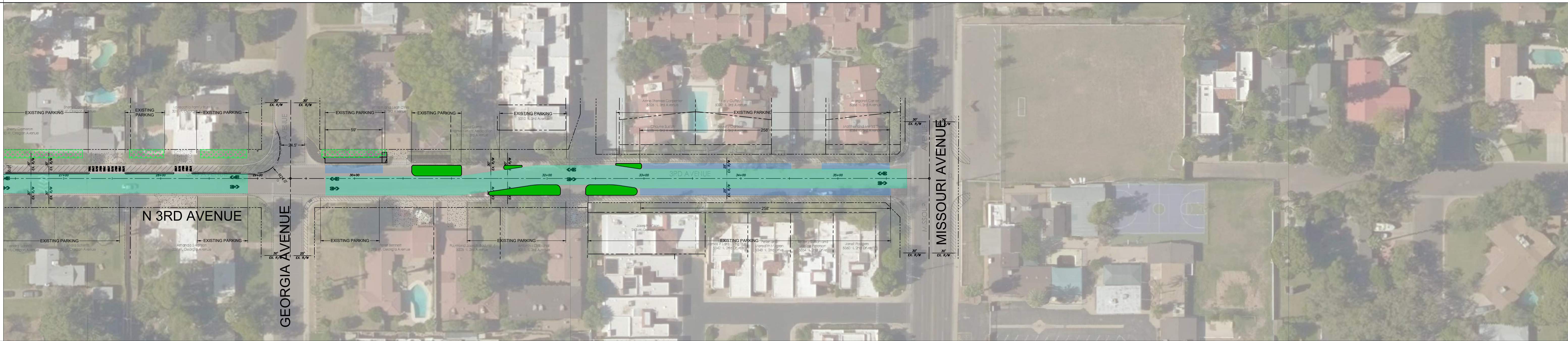
TYPICAL SECTION: CHICANES